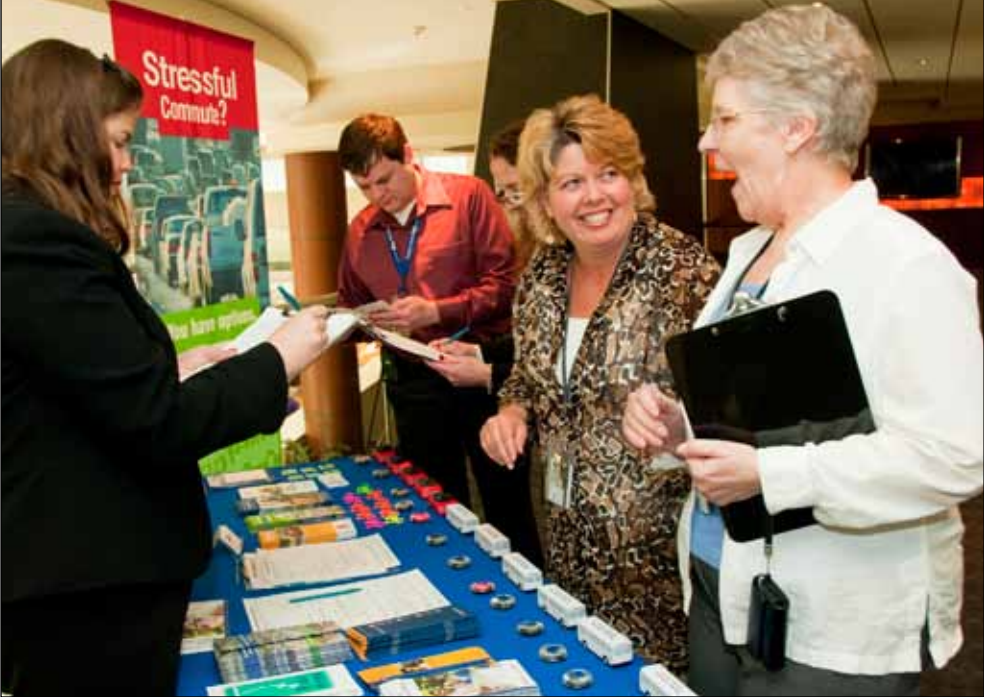
The Commission also serves as a Transportation Management Organization (TMO) in our member cities, working with employers to encourage the use of transit, bike and walk to work options, telecommuting and ride share programs.