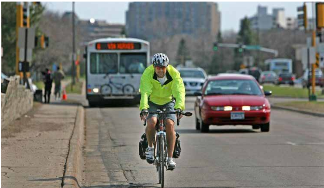
The 494 Corridor Commission has successfully shifted 2,521 “drive alone” commuters to alternative modes, thereby reducing congestion in the 494 corridor in 2015.

However, due to changes in the interpretation of the use of Federal Congestion Mitigation and Air Quality Improvement (CMAQ) Program funds under MAP-21,