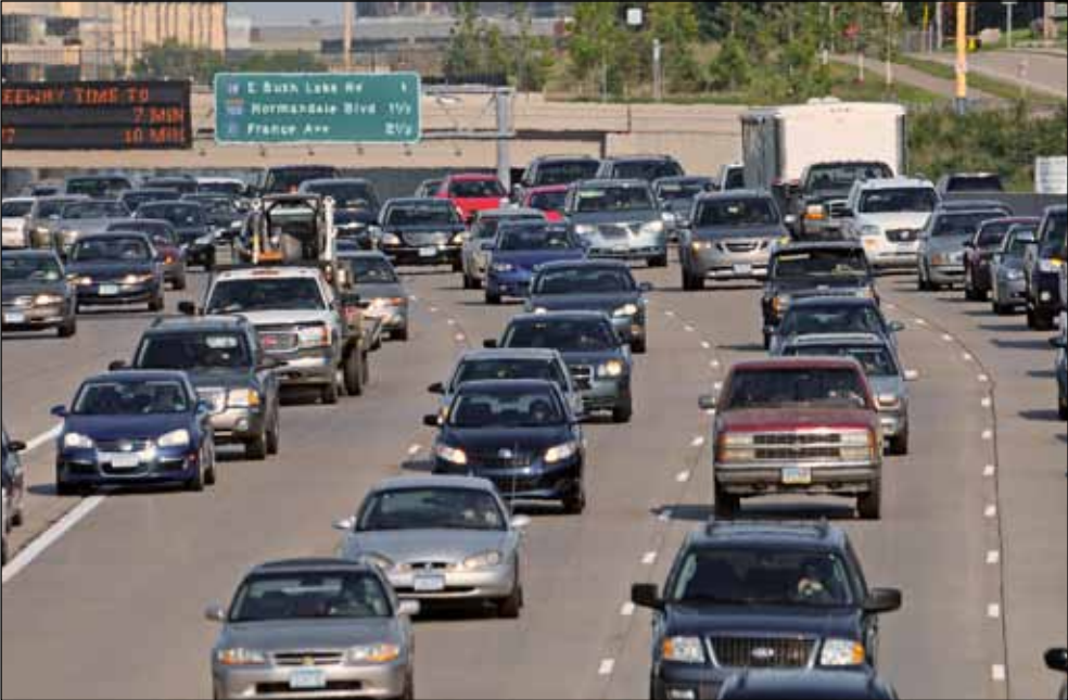
The 494 Corridor Commission has successfully shifted 2,521 “drive alone” commuters to alternative modes, thereby reducing congestion in the 494 corridor in 2015.